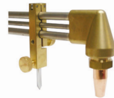
Pivot Guide - TJ111535

The Precision Circle Cutting Guide is designed to help cut accurate circular, semi-circular and round-edged cuts and is extremely manoeuvrable – giving the user complete control over the position and diameter of the circular cut.