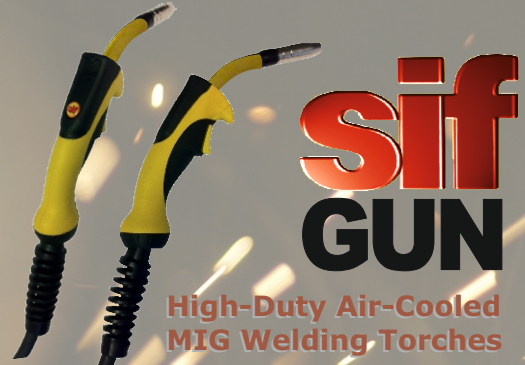
High-Duty Air-Cooled MIG Welding Torches