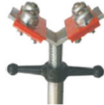
Ball Transfer 450kg Capacity