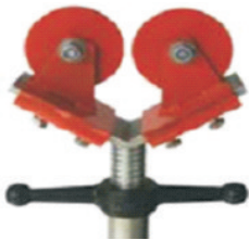
Steel Wheel 450kg Capacity

Full 1 tonne load capacity. The safety features incorporated prevent the sudden collapse of the pipe and protect against hand injuries.