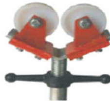
Nylon Wheels 450kg Capacity