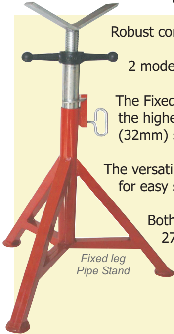
Fixed leg Pipe Stand

Both the models are adjustable in height from 27 1/2"(70cm) to 48" (122cm) and available with a choice of four interchangeable head styles : Stainless Steel Vee-head, Ball transfer head, Steel wheels head and Nylon wheel head.